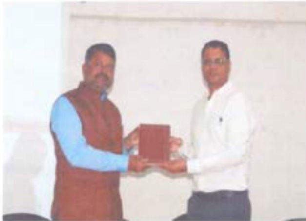
Felicitation of Guest