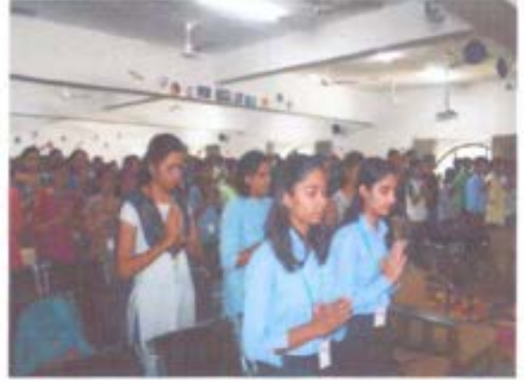
Glimpse of Prayer